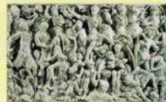
Battle scene carved in marble

There are two different types of soldier in the Roman army – legionaries and auxiliaries. If you're a Roman citizen you can join as a legionary. If you're not a Roman citizen, you'll be recruited as an auxiliary. You will provide extra manpower to assist the legionaries. You could also be deployed as an expert to fight using your own native techniques.